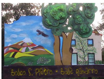
Renelle Base - Santo Pietro Wood - Caltagirone