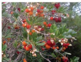
Corbezzolo ( Arbutus unedo L. )